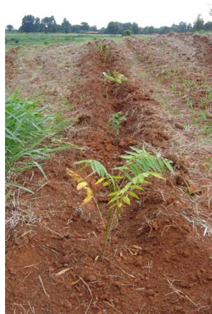
Figure 2 Picture of the areas of permanent preservation with the seedlings planted in Rural Settlement of Porto Feliz, Brazil.

Within these activities, some producers have already begun the planting of certain crops between the trees (Figure 3).