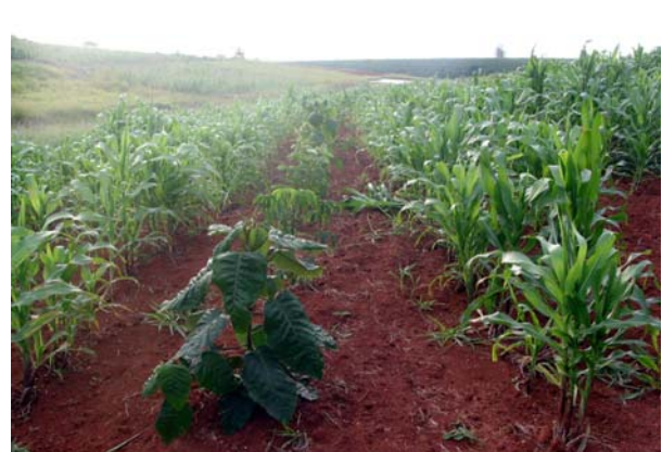
Figure 3 Images from plantations of trees interspersed with some crops in the restoration of Porto Feliz.